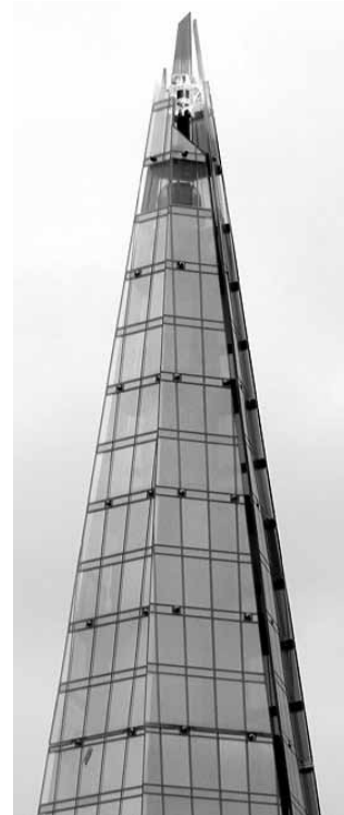
A four-metre model of the Shard has been unveiled at the Babbacombe Model Village in Devon. www.London-SE1.co.uk/n6736