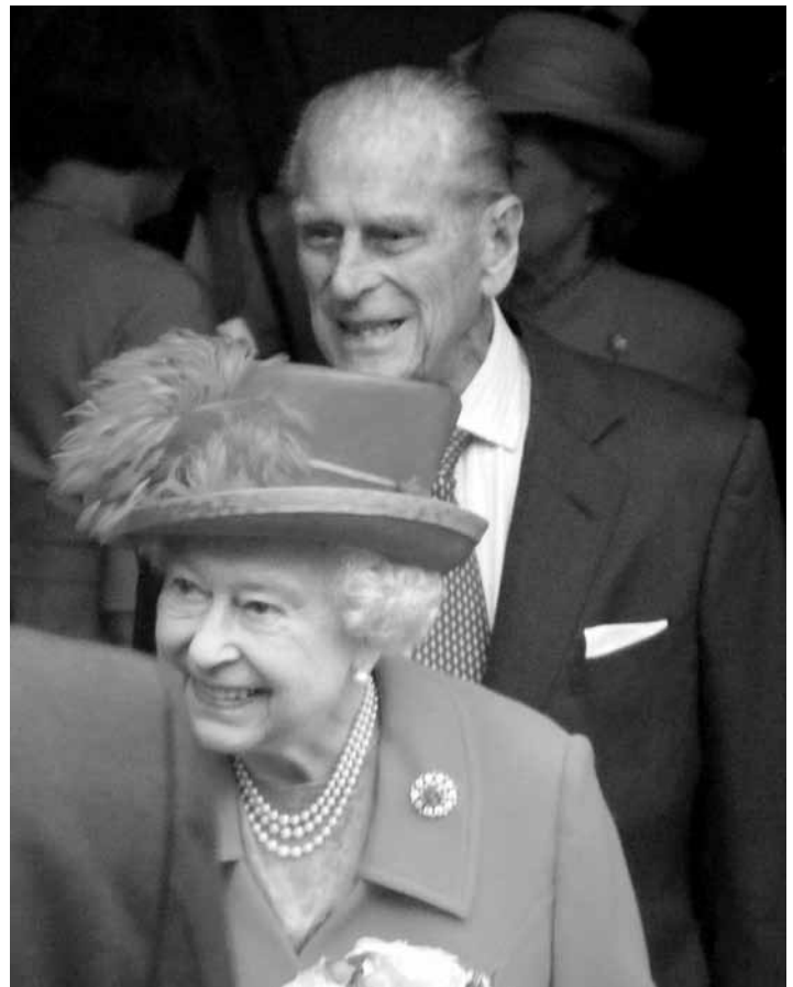
The Queen and Duke of Edinburgh pictured at the National Theatre last month. On Tuesday 19 November Prince Philip will visit Bankside to open the new Sam Wanamaker Playhouse at Shakespeare's Globe. Two days later he will return to SE1 with the Queen to visit Southwark Cathedral.

• After the Borough High Street service the Mayor of Southwark will travel to Geraldine Mary Harmworth Park to take part in an Act of Remembrance at the Soviet War Memorial.