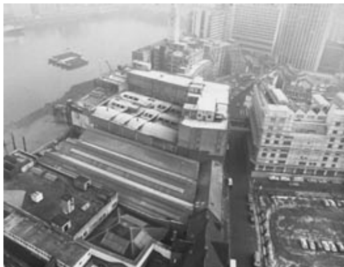
The Coin Street site in 1984

COIN Street Community Builders is mounting a 20 Years of Change exhibition at the Bargehouse on Oxo Tower Wharf. The South Bank site was derelict when purchased by CSCB in 1984.