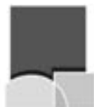
WILLIAM MARTIN PROPERTY AND CONSTRUCTION CONSULTANTS

2/7 Brewery Square Butler's Wharf London SE1 2LF Tel: 020 7378 5800 Fax: 020 7357 6128 www.william-martin.co.uk ilong@william-martin.co.uk www.f-o-m.com