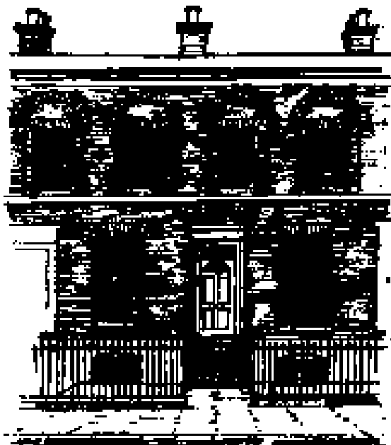
The Walk Gallery in King Edward Walk celebrates its first anniversary - see page 5

The Hayward Gallery is staging drop-in talks and allowing Lambeth residents (with proof of address) to visit the controversial Bruce Nauman exhibition free on Sunday 26 July. Downstream behind Butler's Wharf the Tom Blau Gallery is hoping for an increase in local visitors to its By Association show looking at nuclear locations and featuring live cockroaches. Meanwhile activities at