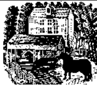
Woodcut by Eric Ravilious for the first London Transport Country Walks book on show at the Design Museum. See listing for details