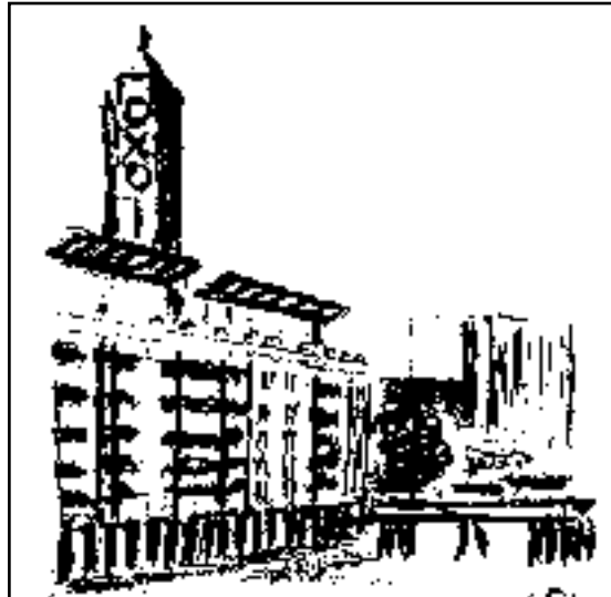
Oxo Tower Wharf by John Bird whose paintings of the Thames are on show in the.gallery@oxo. See Exhibition Review and listing on pages 4 and 5.

•Sainsbury's head office, on the west side of Christ Church, are helping to fund the new landscaping of Christ Church Gardens as part of the South Bank's continued regeneration programme.