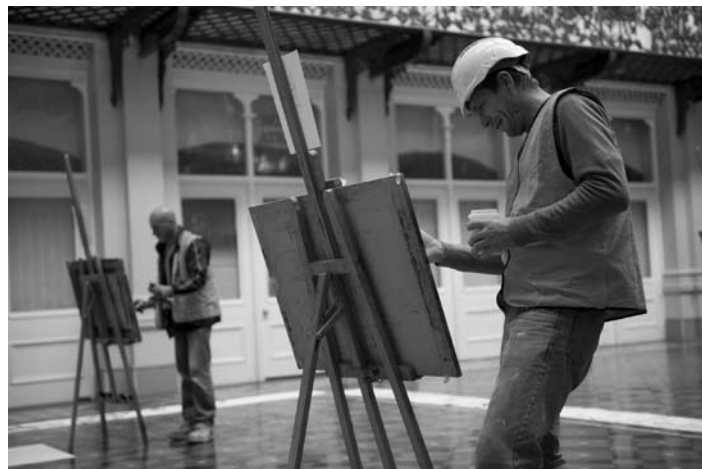
London's largest line drawing at the Hop Exchange as part of Drawn to Bankside last year

The Campaign for Drawing's nationwide Big Draw festival starts on 1 October. The flagship event will be held in the area between London Bridge and Tower Bridge on Friday 22 and Saturday 23 October.