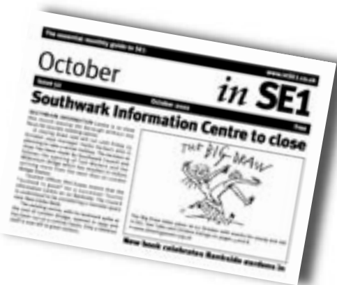
How we covered the closure of the Southwark Information Centre in our October 2002 issue.

SOUTHWARK COUNCIL is opening a Tourist Information Centre in the Vinopolis attraction opposite The Anchor on Bankside.